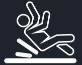
Property Damage & Liability