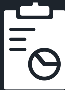
Document and Time Stamp Entry and Exit Traffic

Stealth offers remote gate and integrated access control solutions for shopping centers, apartment buildings, transportation & logistics centers, warehouses, retailers, construction sites, office buildings and storage facilities.