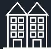
Manage Building Activity