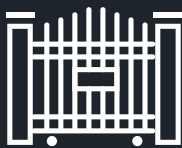
Gate Access Control