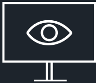
Video Monitoring and Review