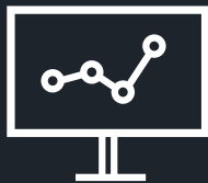
Professional IP Network Design