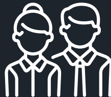
Comprehensive Employee Training

Stealth is a full-service advisor who will work with you to understand your business goals, security concerns, and property.