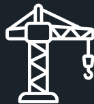
Trespassing, Intruders, & Crane Climbers